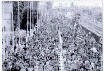
Catalan demonstrators chant slogans as they march during a general strike in El Masnou, Spain, on Friday

Friday's marches have so far been peaceful, ranging from