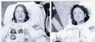
US astronauts Christina Koch (left) and Jessica Meir

In a call to reporters a few minutes earlier, NASA administrator Jim Bridenstine emphasised its symbolic importance.