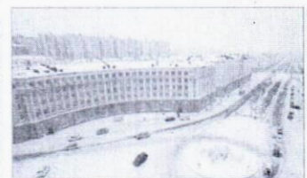
Thawing of once permanently frozen ground covering more than half of Russia is putting buildings, pipelines and other infrastructure at risk of damage

Rising temperatures are a particular worry for mining, oil and gas companies. The permafrost area accounts for 15% of Russia's oil and 80% of its gas operations. It is also home to miners in the Norilsk-Nickel, the biggest refined nickel and palladium producer. Russia has long built structures on piles to improve sta-